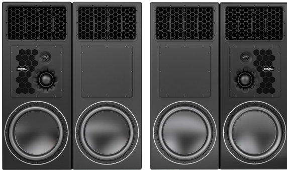
PMC15 XBD (vertical tandem)