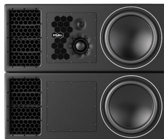
PMC15 XBD (horizontal centre)