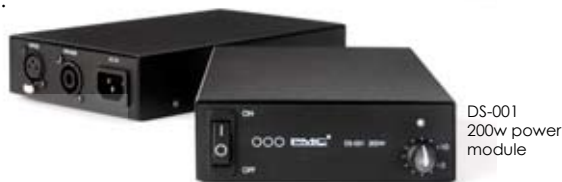
DS-001 200w power module

Pure, ultra clean power at the heart of both the DB1S-AII and TB2S-AII. The DS-001 is an ultra low distortion class D power amplifier and is therefore ideally suited for the reference monitoring purposes. It produces an astonishing 200W into 8 ohms with a flat frequency curve under all loads due to its intelligent feedback circuit. The extremely compact power supply features over current protection and large electrolytic buffer capacitors which allow for large current delivery and vast dynamic headroom.