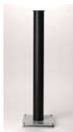
▶ Tube™ 104 stand (1040mm High) Tuned for optimum performance