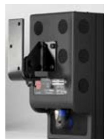
◀ DB1S-AII custom wall bracket. (TB2S-AII takes the Powerdrive WHH 75 or Omnimount 75™)