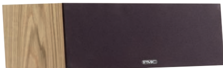
twenty·C in Oak